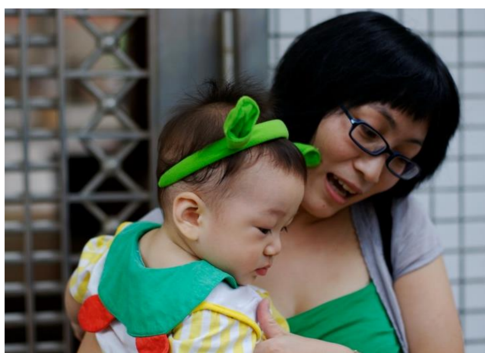
Image (top) courtesy of MD. Hasibul Haque Sakib and (bottom) courtesy of Ran Phang